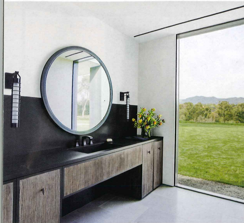
One of the sons' rooms is furnished with a custom-designed bed upholstered in a Pierre Frey fabric and a vintage Danish swivel chair. Above: Vintage Franco Albini wall lights offset a custom-made mirror in a powder room.