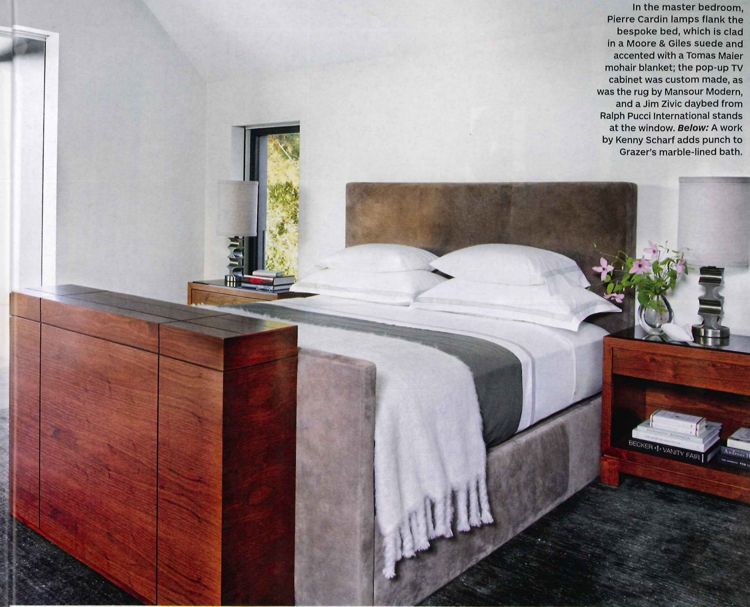
In the master bedroom, Pierre Cardin lamps flank the bespoke bed, which is clad in a Moore & Giles suede and accented with a Tomas Maier mohair blanket; the pop-up TV cabinet was custom made, as was the rug by Mansour Modern, and a Jim Zivic daybed from Ralph Pucci International stands at the window. Below: A work by Kenny Scharf adds punch to Grazer's marble-lined bath.